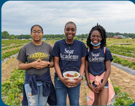
Strawberry Farm (Growing their own food)