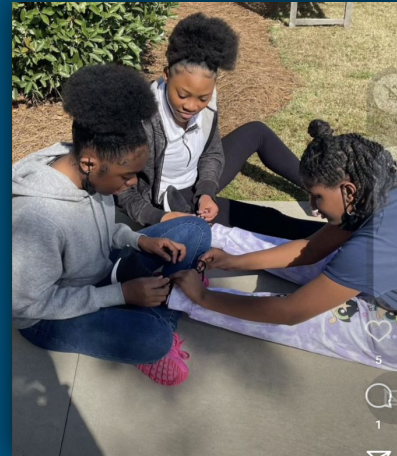
Peers assisting Autistic classmate on how to tie her shoes