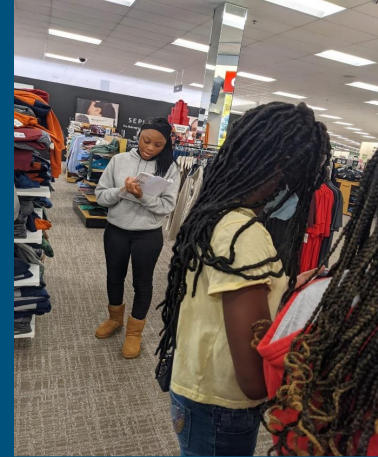
Shopping at Kohls (Understanding Credit and calculating Interest)